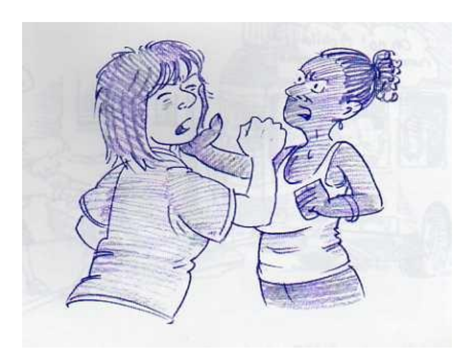
It is \overline{\mathbf{OK}} to hold firmly to stop a child from hurting a young person or adult.

It is \mathbf{OK} to hold firmly to separate two children who want to hit or hurt each other.