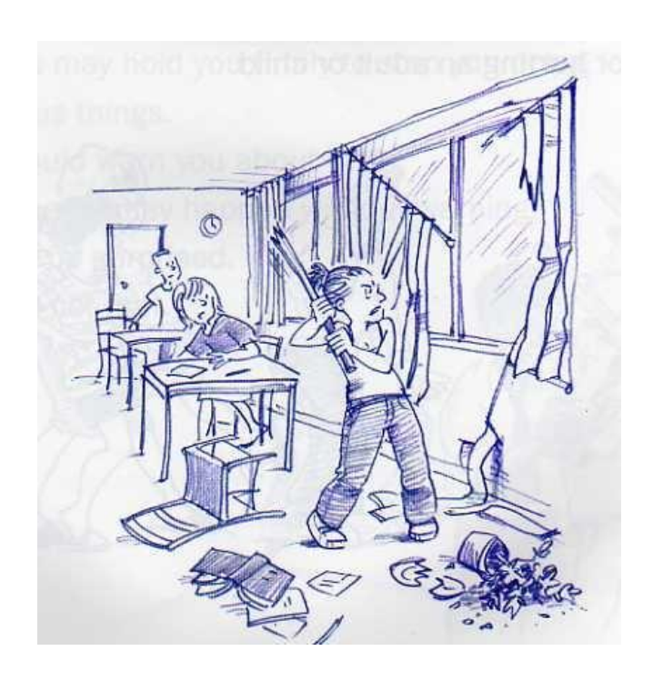
I hope this helps to reassure you that your child will be kept safe and free from harm, here at Oakwood.